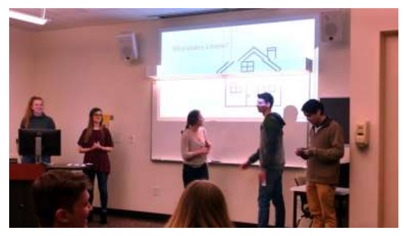
WWU students walked us through the process of working on the video on campus, March 7.

The students did an outstanding job (even though all of their original filming dates were snowed out!). They interviewed Leadership Council members at BSAC, took footage of the inside of our office, and edited everything together beautifully. They managed to capture the unique spirit of Bellingham At Home in seven minutes, weaving together comments from each interview in a way that feels like a casual conversation.